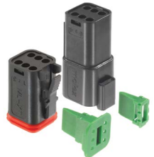
6-Circuit ML-XT System