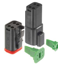
4-Circuit ML-XT System