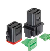
8-Circuit ML-XT System