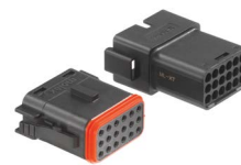
18-Circuit ML-XT System