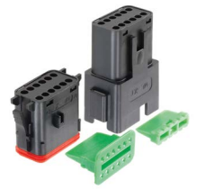
12-Circuit ML-XT System