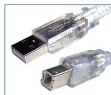
Standard USB cable