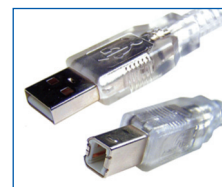
Standard USB cable