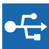
USB 2.0 (optional)