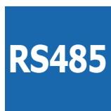
RS485 (optional instead of RS232)